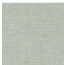
Moss 96330 Weldrod 07332