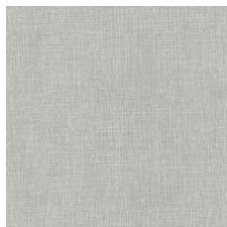
Zen 96515 Weldrod 01203