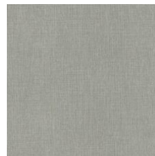
Shakkei 96761 Weldrod 02001