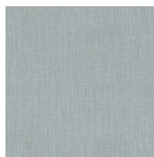
Cascade 96416 Weldrod 05008