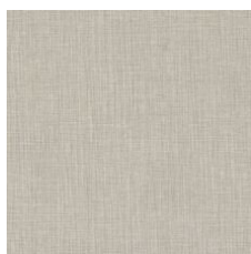
Tea Garden 96216 Weldrod 07332