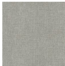
Pagoda 96710 Weldrod 05244