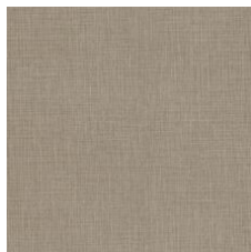
Stepping Stone 96700 Weldrod 02019