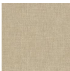
Evening Glow 96130 Weldrod 07331