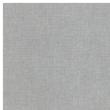
Stroll 96535 Weldrod 01203